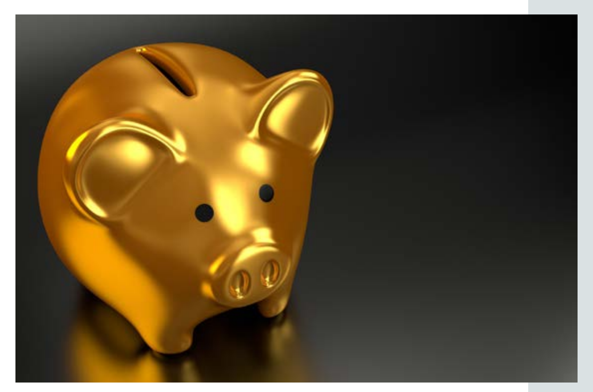
STEP 3: IMPLEMENTATION

A solution free of impediments has been identified to solve a problem. Does implementation of the solution require a plan update? If so, does the solution create a new benefit or reduce a current benefit? Will the solution be implemented mid-year via an amendment or at plan renewal? Will other documents need to be updated as well, like the Summary of Benefits and Coverage (SBC)? Are there concerns about the Affordable Care Act (ACA) or the Employee Retirement Income Security Act (ERISA) timelines or rules?